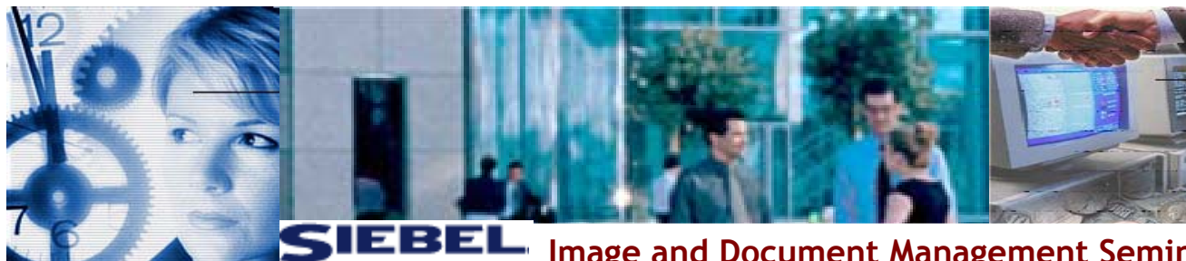
Image and Document Management Seminar 30 th Sept, 10:00am IBM Southbank London

It is with pleasure that Electronic Archive Solutions (e-ASL) and Akibia invite you to our Siebel Imaging, Document Management, and Voice archive seminar at IBM South Bank London on Tuesday the 30 th of September 2003.